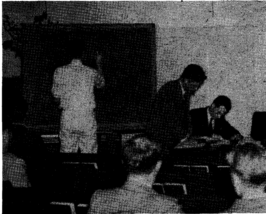
POSTING THE RESULTS of a ballot to elect the Class of 1946 of the Committee on Foreign Missions.

A debate then ensued which, for a time, threatened to become similar to that occasioned by the Peruvian matter in the report of the Committee on Foreign Missions. It was intro-