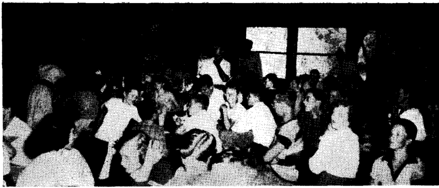
French Creek—Just one part of the Assembly hall following lunch on Labor Day.