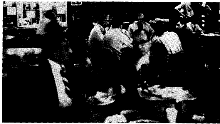
Lunch break in the dining hall of Trinity College.