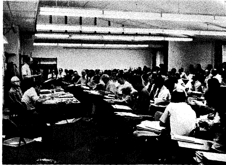
The Forty-first General Assembly in session on a warm and humid day.

committee maintained. Not least in the considerations behind this sentiment is the very remarkable evangelistic outreach achieved by these printed bearers of the gospel of God's grace.