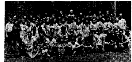
Campers at Suttle Lake